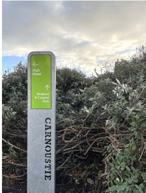
Carnoustie town centre heritage trail installed in 2021/22. Designed and developed by Placemarque Ltd.